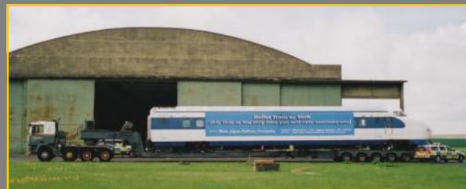
Moving a Japanese "Bullet Train" from Southampton Docks to the National Railway Museum in York.