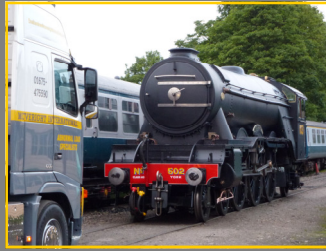
Moveright International Ltd moved the world-famous "Flying Scotsman" locomotive from Bury to the National Railway Museum in York following its £1.6m overhaul.

MOVERIGHT INTERNATIONAL LIMITED: Keeping Industry Moving