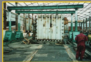
Using a 400 tonne capacity "Mega Lift" system in order to undertake the removal of three 70 tonne furnaces prior to transportation to Liverpool for export.